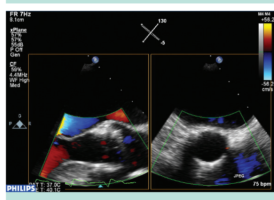
After the TAVR procedure, Gellert checks the results. The image on the right shows the new valve in place, without any paravalvular leak.

Gellert uses 3D ultrasound and Philips QLAB to precisely measure the aortic annulus. By using multi-planar reconstruction planes (red, green and blue MPRs), he can reconstruct an ellipse (shown in yellow) that marks the annulus, and then measure it accurately. Although the annulus is an ellipse, it conforms to the circular shape of the artificial valve once the valve is placed.